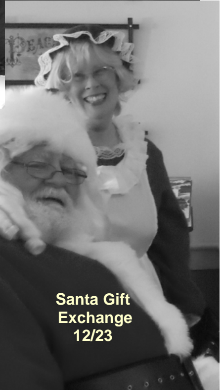
Santa Gift Exchange 12/23