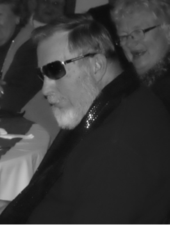
Christmas parties, dinners, concerts