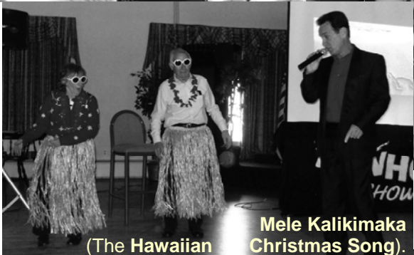
Mele Kalikimaka (The Hawaiian Christmas Song).