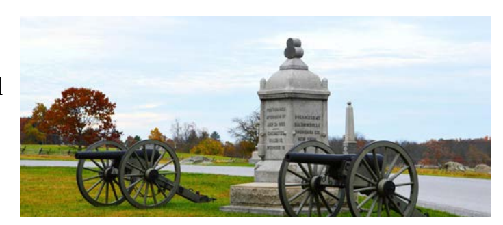
Bus Tour - Amish, Queen Esther, Gettysburg: Sep 20-24, 2021. Queen Esther at Sight & Sound Theatre, Gettysburg; Amish tour, & Landis Valley. $595. http://www.grouptrips.com/ gibsoncenter

Bus Tour - Cape Cod, Martha's Vineyard, Rhododendron Festival: Postponed http:// www.grouptrips.com/gibsoncenter