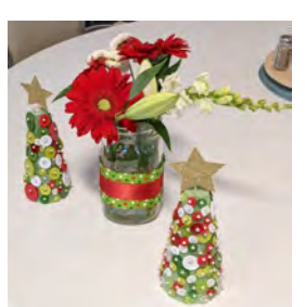
K Kid decorations