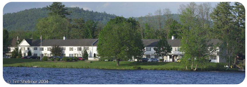
Located on the shore of Silver Lake in Madison, NH. Vacancies occur occasionally, call Ken to inquire or to be put on the waiting list